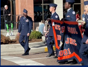
Mitchell HS AFJROTC

The 23 rd Annual Veteran's Day Parade was held in downtown Colorado Springs with 81 organizations participating in this event. Organization represented included veteran organizations, business organizations, civic groups, and military units. JROTC