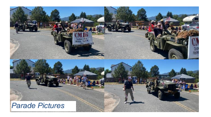
a vin deares